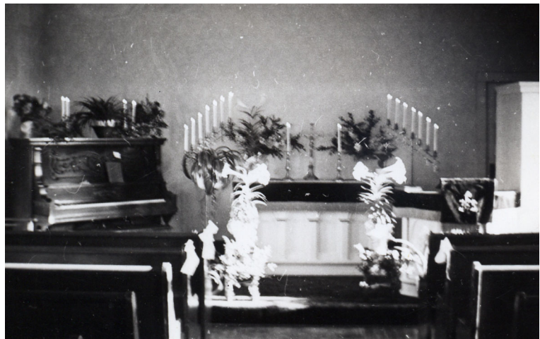
Sanctuary of Original Building Picture taken on Easter Sunday.

It was during a longer vacancy of two years from 1947-49 that members began discussing the advisability of moving the church to town, as many other congregations had done. This was necessary for various reasons. In the country the church had no future. It was difficult to procure the service of the pastor for a place that offered little prospect for future growth and development.