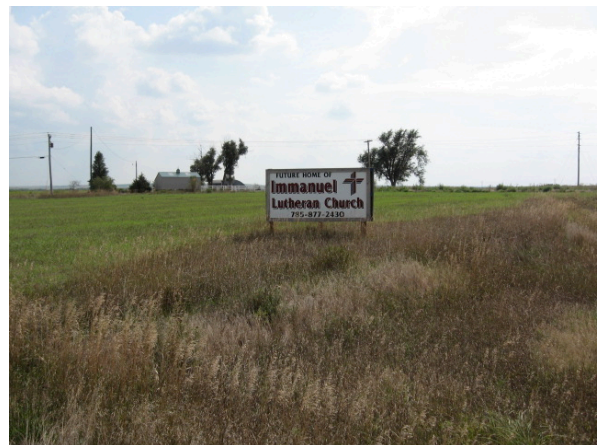
Future Home of Immanuel Lutheran Church