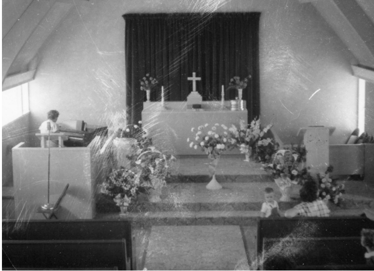
Sanctuary at current church before renovation.

In 1950 the congregation moved to Norton as the potential for future growth and development was much greater in town than in the country. The present facility was built at an estimated cost of $30,000. Of this amount, $15,000 was borrowed; after five years the congregation was debt free.